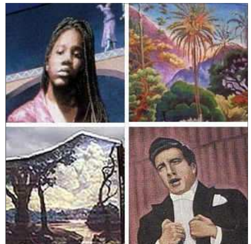
Details from four Philadelphia neighborhood murals.