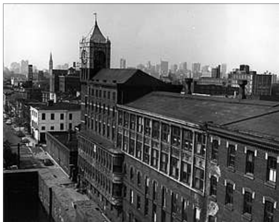
Vacant John B. Stetson Hat Manufacturing, exterior. August 9, 1977.

1920s, the plant employed more than 5,000 men and women and produced more than three million hats a year. Paternalistic John Stetson established employee institutions that included a school, a hospital, and a building-and-loan society that encouraged homeownership. The Great Depression of the 1930s and changing fashions ultimately crippled the company, and the plant closed in 1960. Today, the site is vacant land.