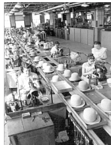
John B. Stetson Hat Manufacturing, assembly line. 1952.

As Philadelphia's manufacturing sector declined during the late 20th century, many other companies in the vicinity of American Street and Germantown Avenue went out of business, leaving behind deteriorated, multistory, masonry structures that could not be readily adapted to modern industrial needs. In the 1970s, the City of Philadelphia began demolishing buildings and assembling parcels of land. The area became an attractive location for firms that valued